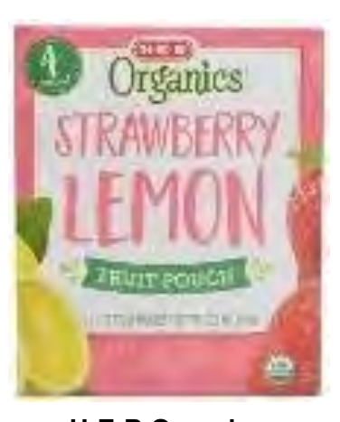
H-E-B Organics Strawberry Lemon Fruit Pouches