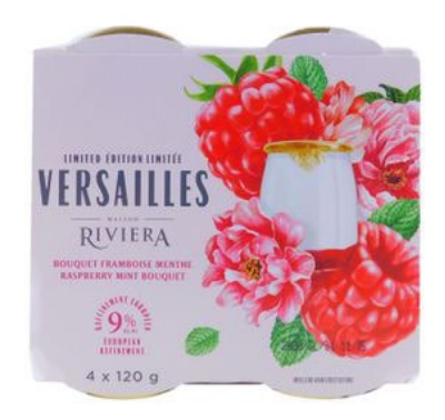
France- contains 9% European refinement milk fat

Restrictions imposed by the pandemic have reduced consumers' ability to travel, eat out and socialize, forcing them to spend more time at home. This has had a tremendous impact on mental wellbeing, stress levels and overall satisfaction with life. The appeal of new flavors can drive interest and engagement