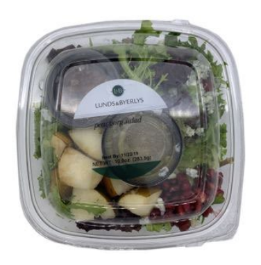
Lunds & Byerlys PearGorg Salad

Most salads do not include snack positioning, but some European markets are an exception that can serve as guidance for the rest of the world. "Snack salads" have proliferated in Germany and have spread into other European markets. This growth can inspire salad makers in other global markets.