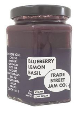
Organic Food Incubator: Features "Low Sugar" label on front label