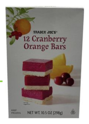
A classic lemon bar with a tangy cranberry curd and sweetened orange peel filling

Although not new on the flavor scene, citrus flavors are experiencing high interest. Lemons, blood oranges and grapefruit are increasingly featured in new food and drink products with the immunity-boosting functional claim.