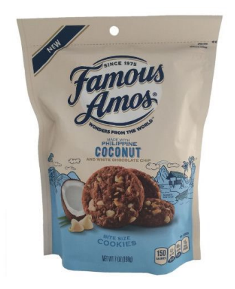
This product is said to offer a premium twist with delectably sweet coconut flakes sourced exclusively from the Philippines

of US consumers have been eating indulgent foods regularly since the beginning of the COVID-19 pandemic (vs 34% prior)