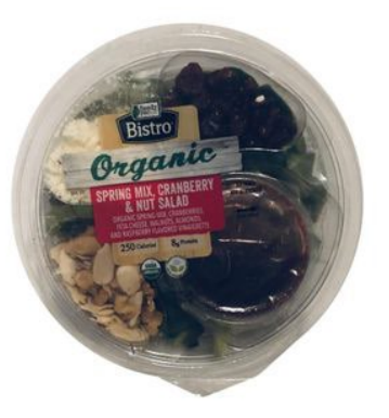
The product comprises an organic spring mix, cranberries, feta cheese, walnuts, almonds and raspberry vinaigrette.