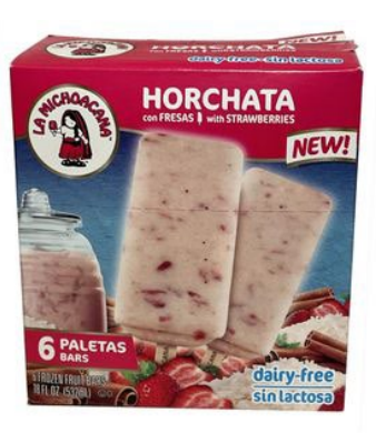
Mexico- Filled with strawberry chunks and crafted with the finest horchata recipe