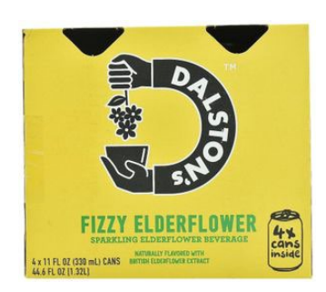
<u>Dalston's Fizzy Elderflower Beverage</u> is naturally flavored with British elderflower extract.

When it comes to alcoholic beverages, <u>46% of</u> <u>consumers prefer citrus flavors and 16% prefer floral</u>. Lavender (61%) and Hibiscus (14%) are among the beverage flavors that have grown the most from Q2 2018-21.