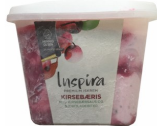
Premium Cherry Ice Cream - Norway