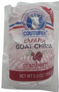
Cranberry Flavored Creamy Goat Cheese - USA