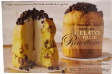
Gelato Filled Panettone - USA