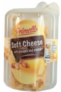
Soft Cheese with Pineapple and Almonds - Germany