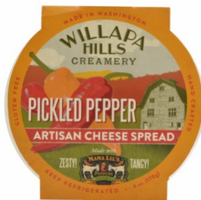
Pickled Pepper Artisan Cheese Spread - USA