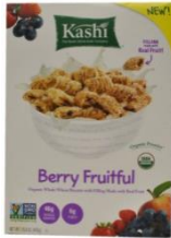
Kashi Organic Whole Wheat Cereals with Real Fruit Filling