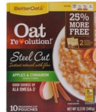
MOM Brands Apple & Cinnamon Instant Oatmeal with Flax