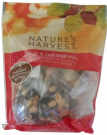
Fruit & Nut Trail Mix- USA