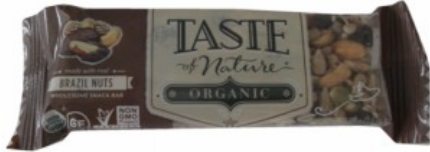
Organic Wholesome Snack Bar with Brazil Nuts - USA