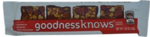
Snack Squares Crafted with Cranberry, Almond, Dark Chocolate- Puerto Rico